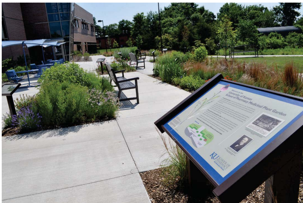
Figure 3: KU School of Pharmacy Garden 2011. Kansas Biological Survey.

The gardens installed by the Native Medicinal Plant Research Program represent a strong connection with Sayre's work. Though only one element of an extensive program that includes wide-ranging research activities, this garden, in addition to a research garden we developed on agricultural land north of Lawrence, may constitute the most visible part of our work. Both gardens were planted during public events and are open to the public, and regular tours are held at the research garden.