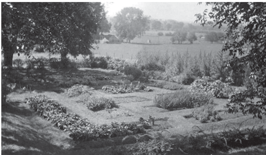
Figure 2: KU School of Pharmacy Garden, 1927. Medicinal plants growing in the garden included: marshmallow, Althaea officinalis ; absinth, Artemisia absinthium ; cotton, Gossypium hirsutum ; Job's tears, Coix lacryma-jobi ; lambsquarters, Chenopodium album ; rue, Ruta graveolens ; foxglove, Digitalis purpurea ; marijuana, Cannabis sativa ; and poppies, Papaver somnifera .

In spring 2011, the Native Medicinal Plant Research Program, with the help of pharmacy students and other volunteers, planted the garden outside the newly constructed School of Pharmacy building at KU. In homage to the first KU Drug Garden, inspired by Sayre, the new KU School of Pharmacy Medicinal Plant Garden includes a bed with most of the same species grown in 1927.